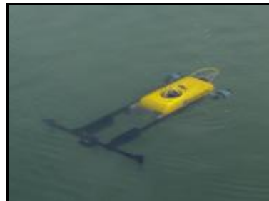
Stingray / Smartrak combination undergoing trials

The combination of the sensitivity of the Innovatum Smartrak, with the compact size, and high power to weight ratio, of the Stingray ROV, provides an easily deployable, yet very effective, package.