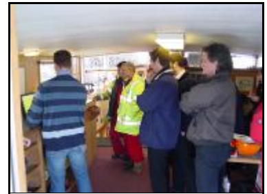
Attendees at the demo aboard the MV Confidante in Lowestoft

MK Services has been working with Teledyne Benthos and Innovatum International to put together an integrated cable tracking package, and it was the resultant package of an Innovatum Smartrak mounted onto a Teledyne Benthos Stingray ROV that was demonstrated to potential customers and their clients.